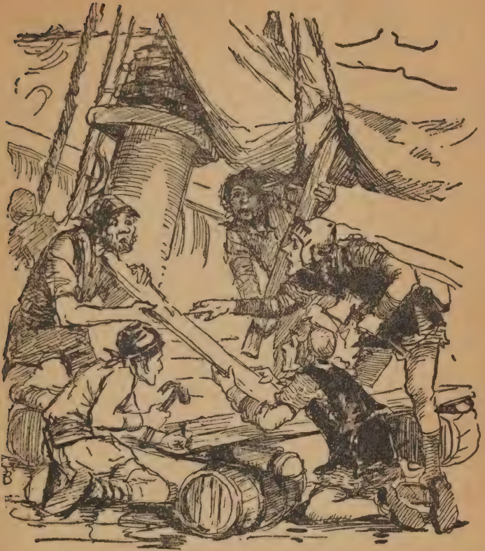
Breaking up the deck to build a raft.

"By the mass!" cried Dick, as the bows of the Good Hope reappeared above the foam, "I thought we had foundered, indeed; my heart was at my throat."